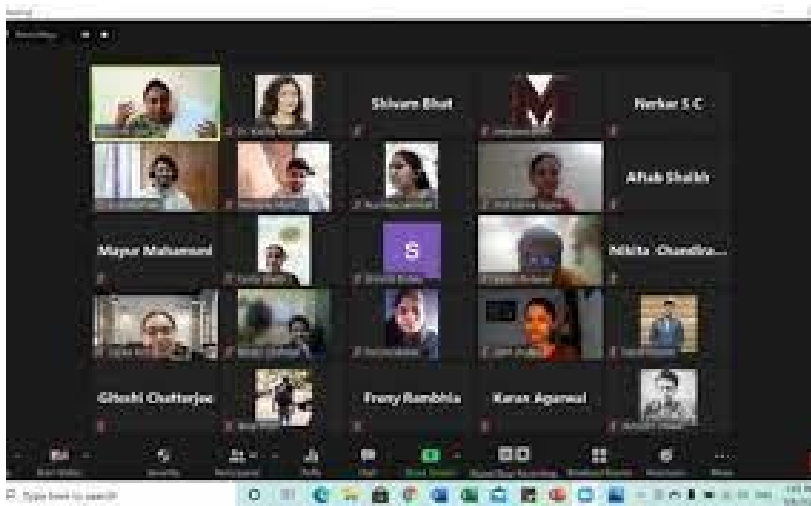
Screenshot of the on-going Webinar on Significance of Geology