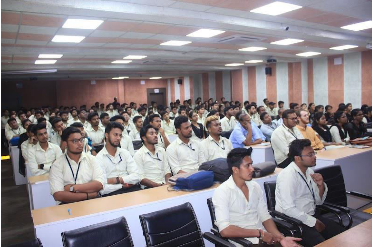
Participants attending the session on Internet of Things