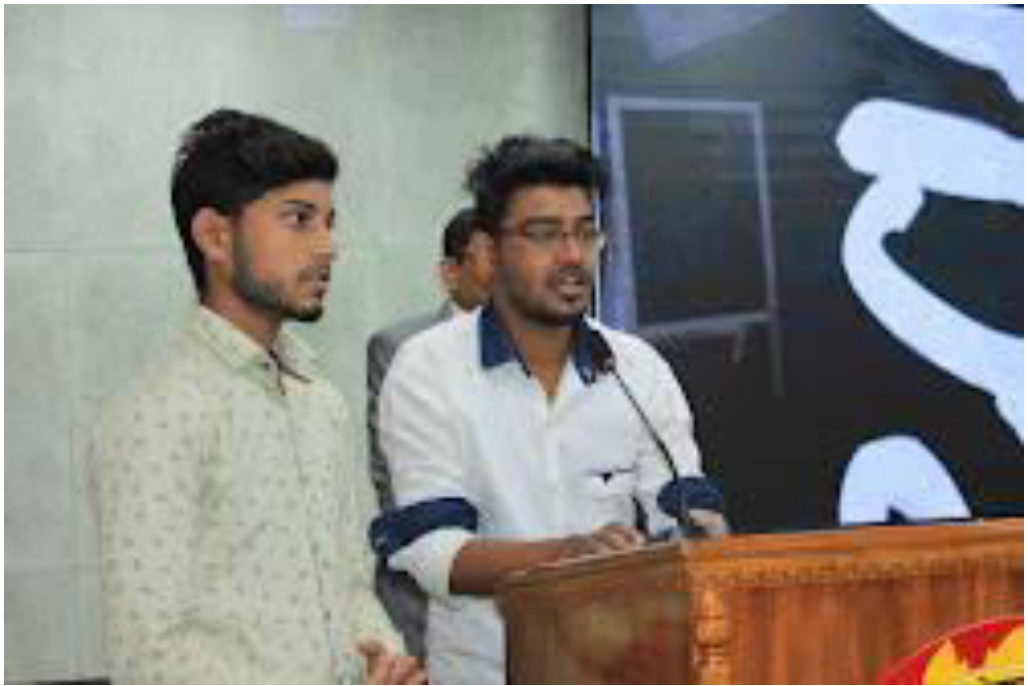
Workshop Demonstration on Solar Thermal Engineering