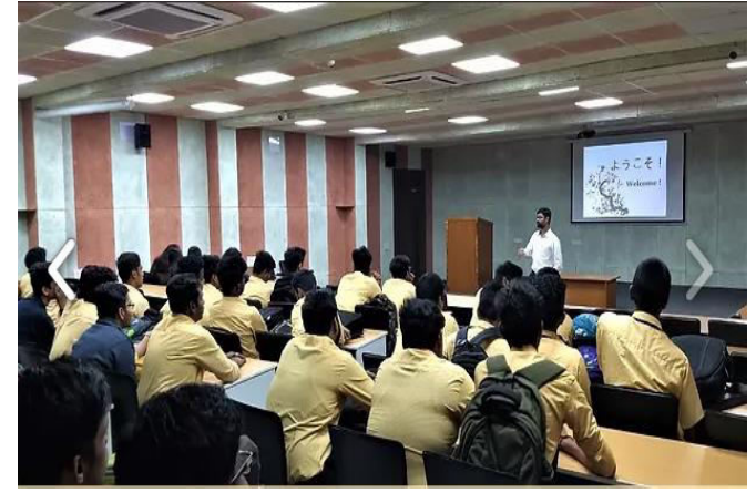
Class on Japanese Proficiency class Session on Japanese Language Proficiency