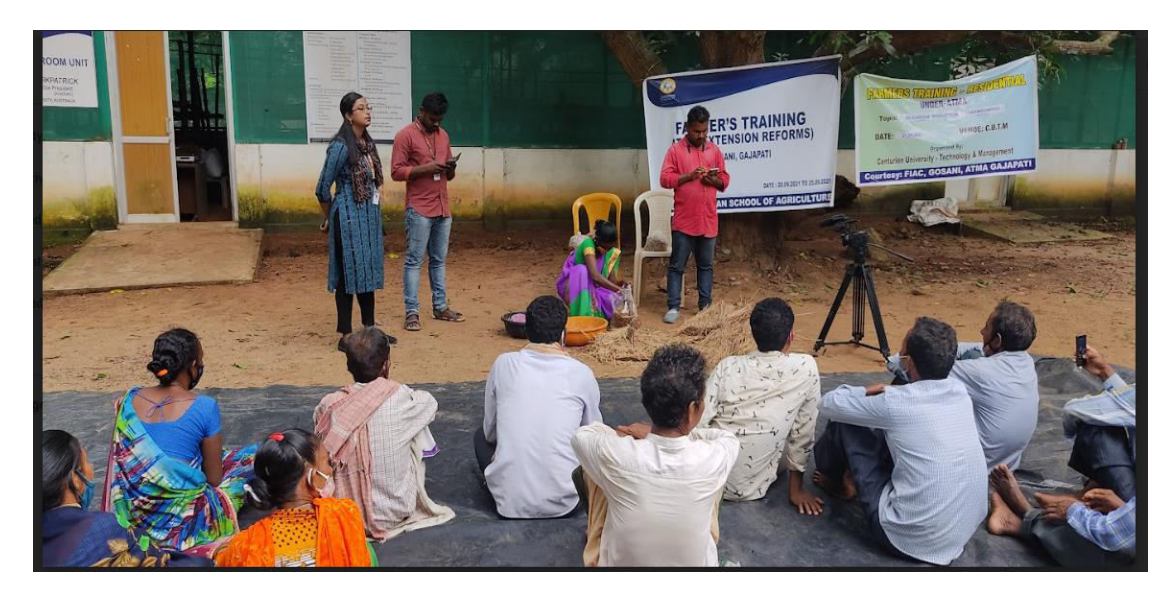
Figure: Clip from the workshop on Mushroom Grower