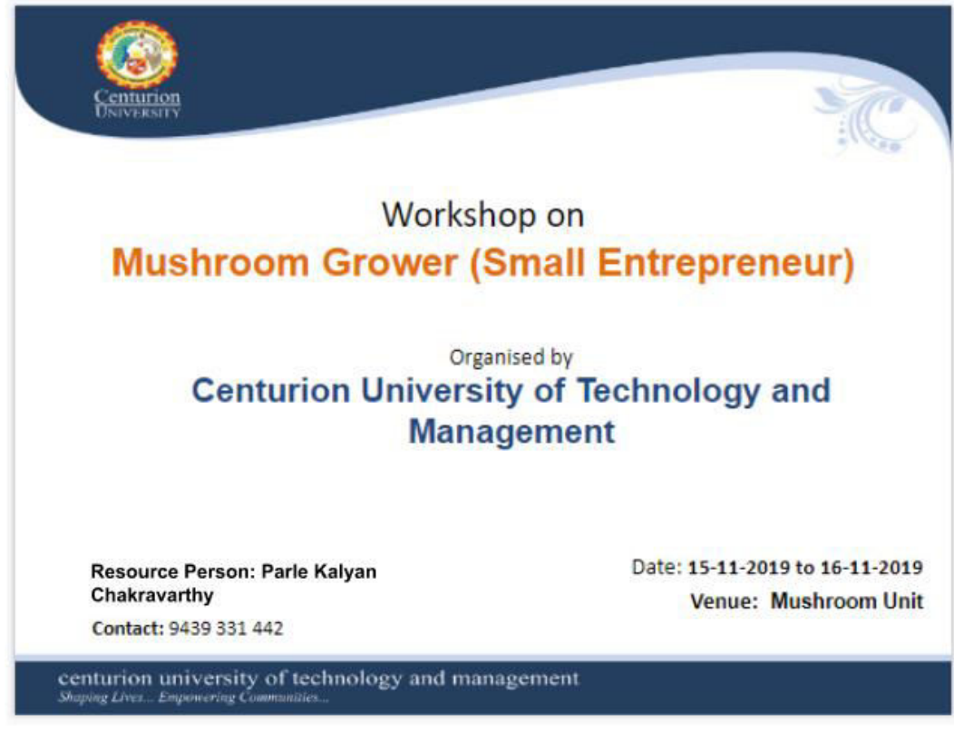
Brochure of the session on the workshop on Mushroom Grower