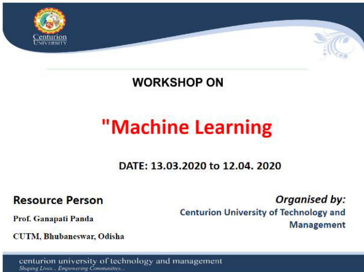
Figure: Brochure of the event

trained to make classifications or predictions, uncovering key insights within data mining projects. These insights subsequently drive decision making within applications and businesses, ideally impacting key growth metrics. As big data continues to expand and grow, the market demand for data scientists will increase, requiring them to assist in the identification of the most relevant business questions and subsequently the data to answer them.