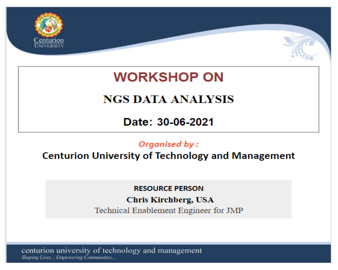
Brochure of the online session