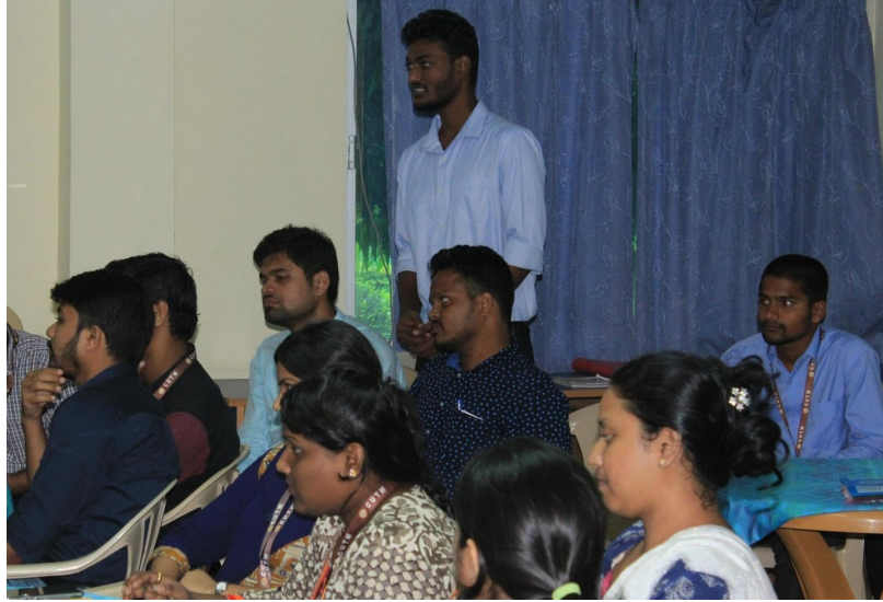
Figure: Participants interacting with the resource person at the workshop