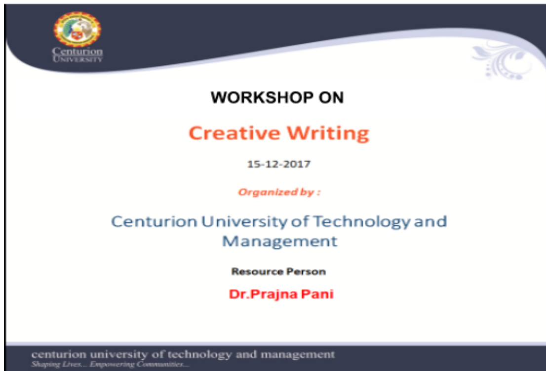
Brochure of the event