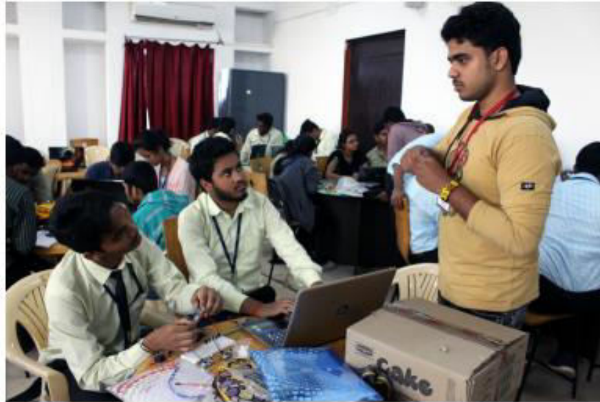
Figure: Participants interacting in the INTERNET OF THINGS USING ARDUINO BOARD workshop