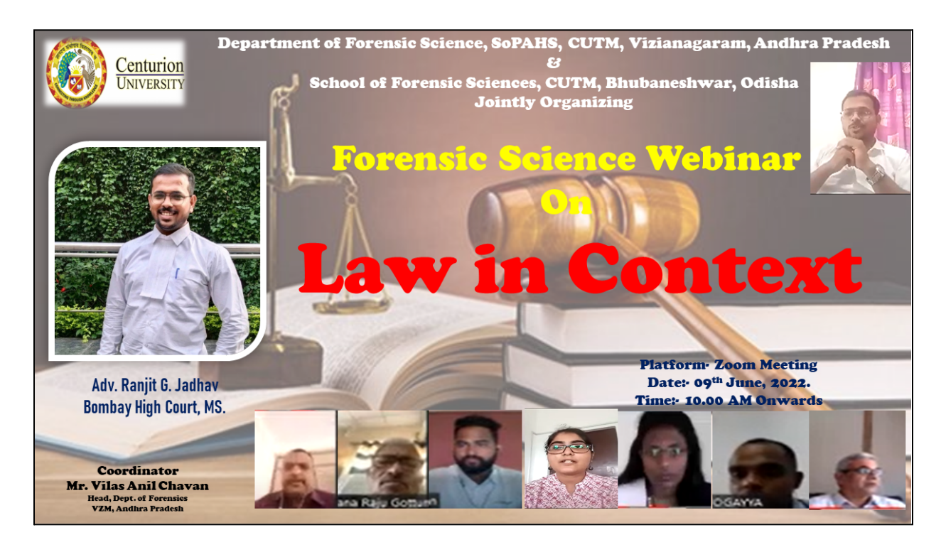
Screenshots of the on-going online webinar