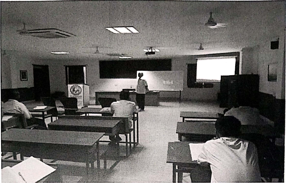
Figure 2 Mathematics_NET_GATE