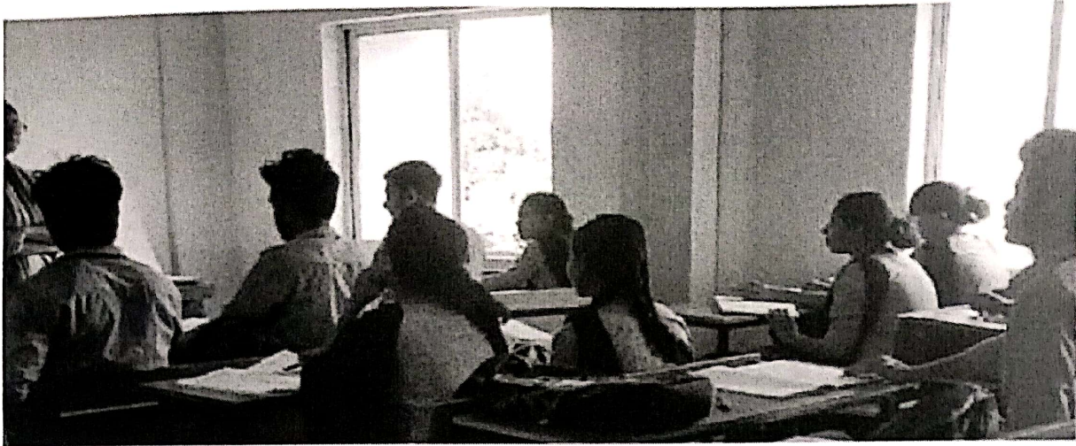
Figure 8SOPLS_ Expert Talk-3