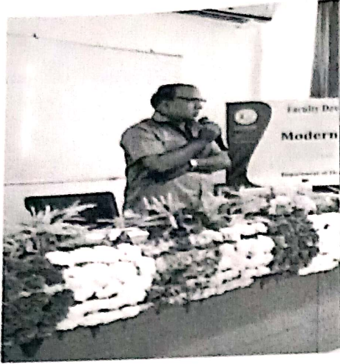
Figure 10EEE_Technical Class 1