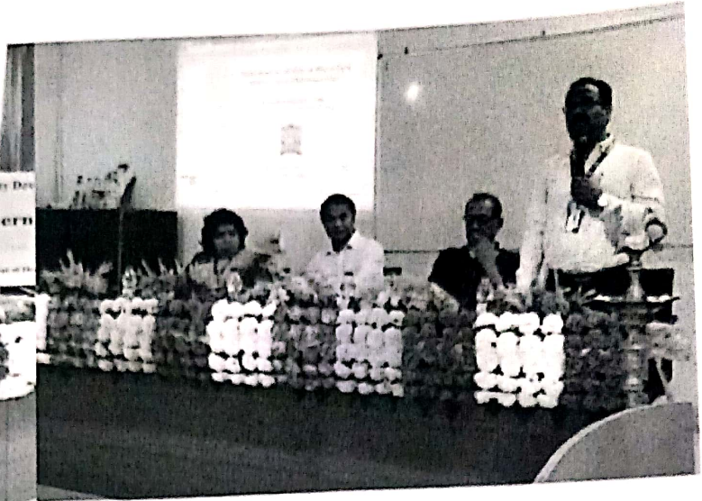
Figure 11EEE_Technical Class 1