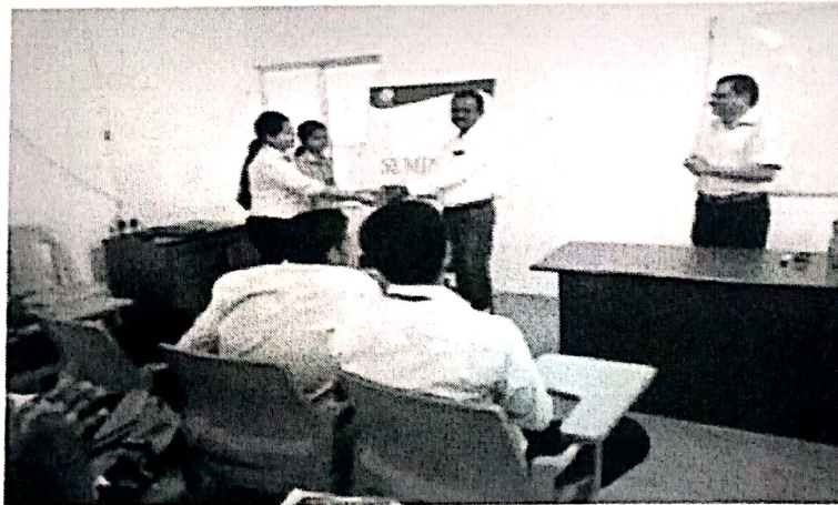
Figure 12 School of Management_Career Counseling 01