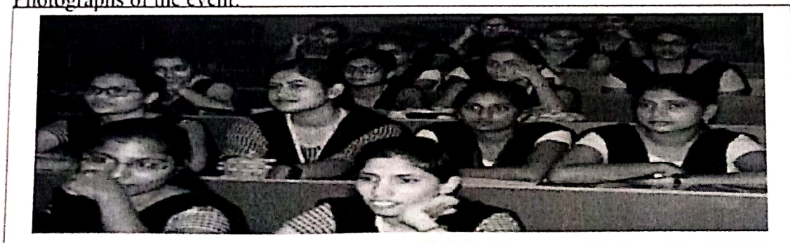
Figure 20EEE__ Technical training