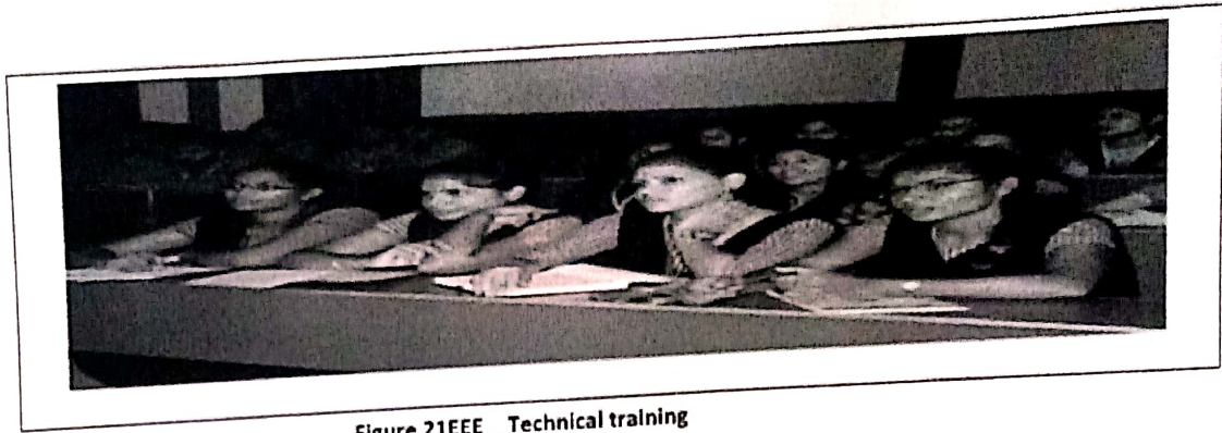
Figure 21EEE__Technical training