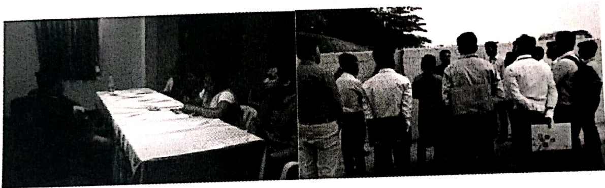
Figure 25 Resource person interacting with students

We are planning to have more such interactions and career counseling sessions in future as well.