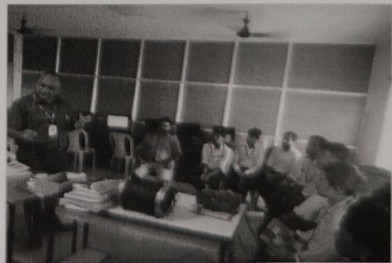
Figure 10 CIVIL_GATE Coaching