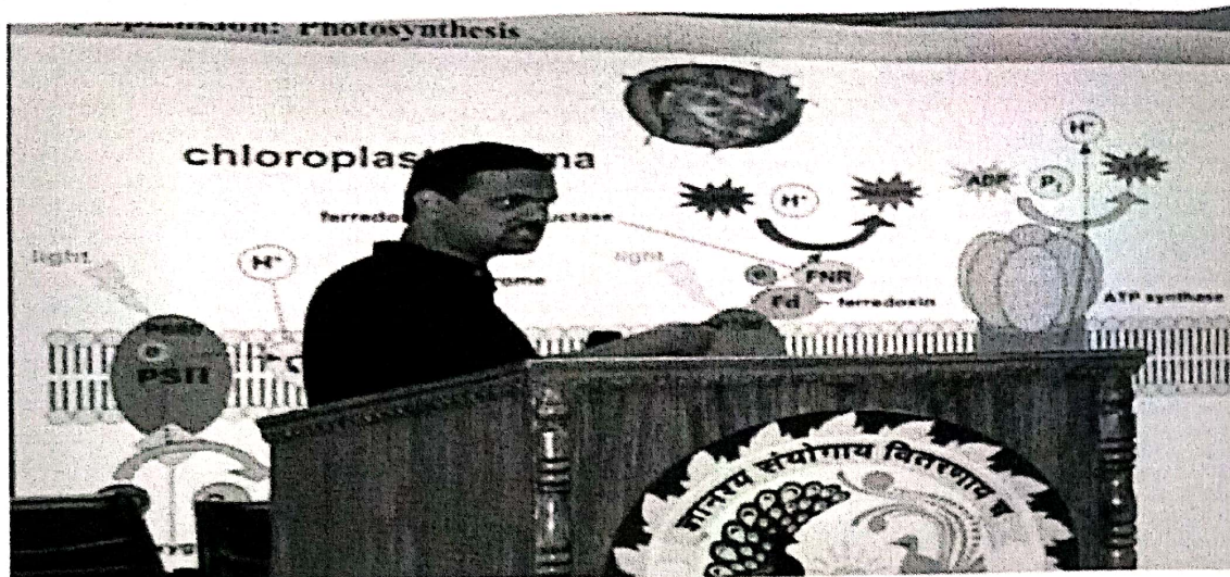
Figure 13CE_Career report1