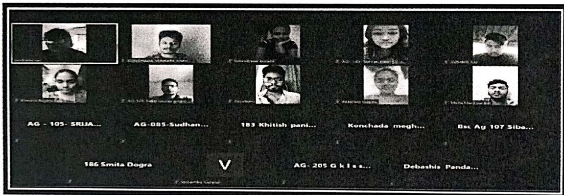
Figure 28 TCS CSR Youth Employment Program in progress in virtual mode