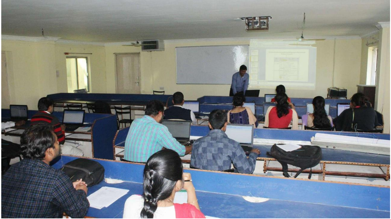
Fig. Participants of MS Excel