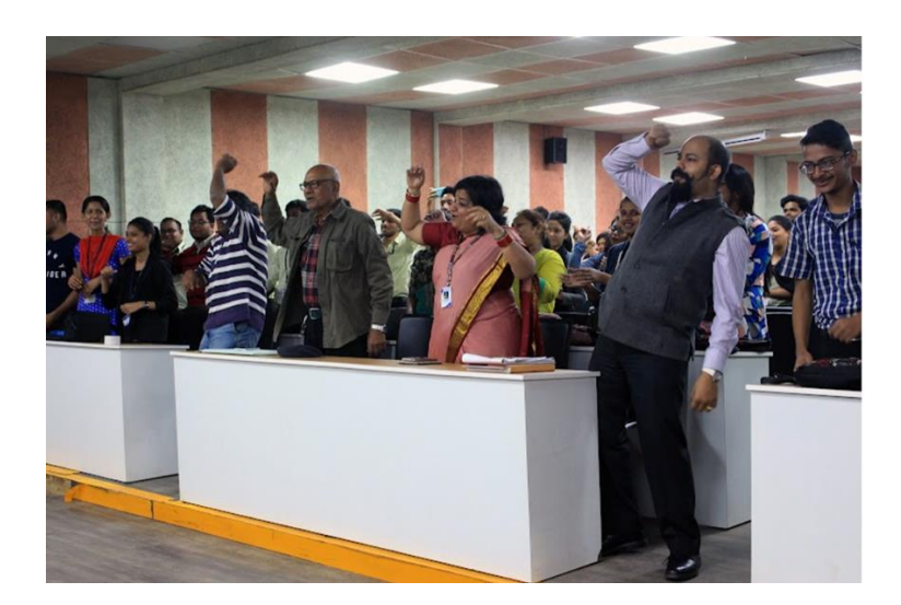
Fig. Participants attending the session