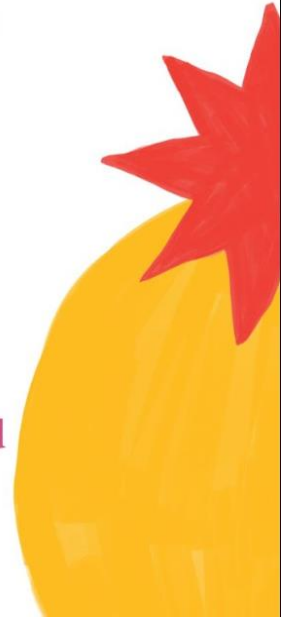
Figure: Brochure of the FDP