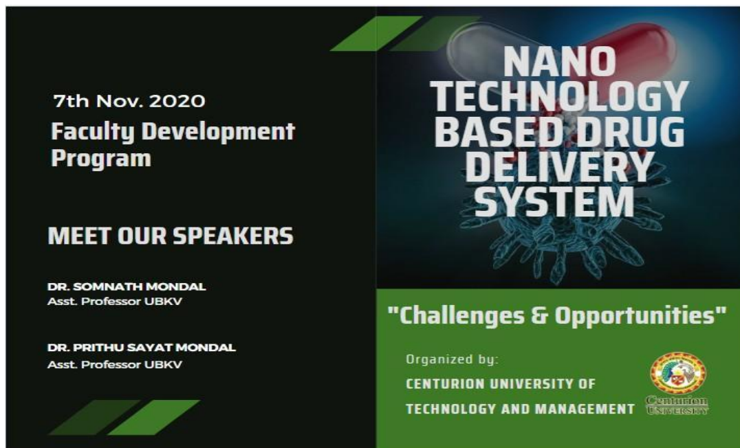
Figure 2: Brochure of the faculty development programme on “ NanoTechnology based drug delivery system”