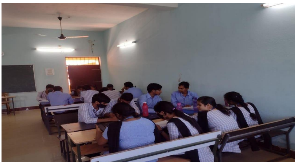
Brain Storming by Students