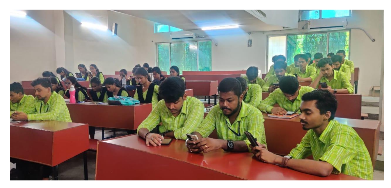
Students engaged in task during the session on 16th July, 2020