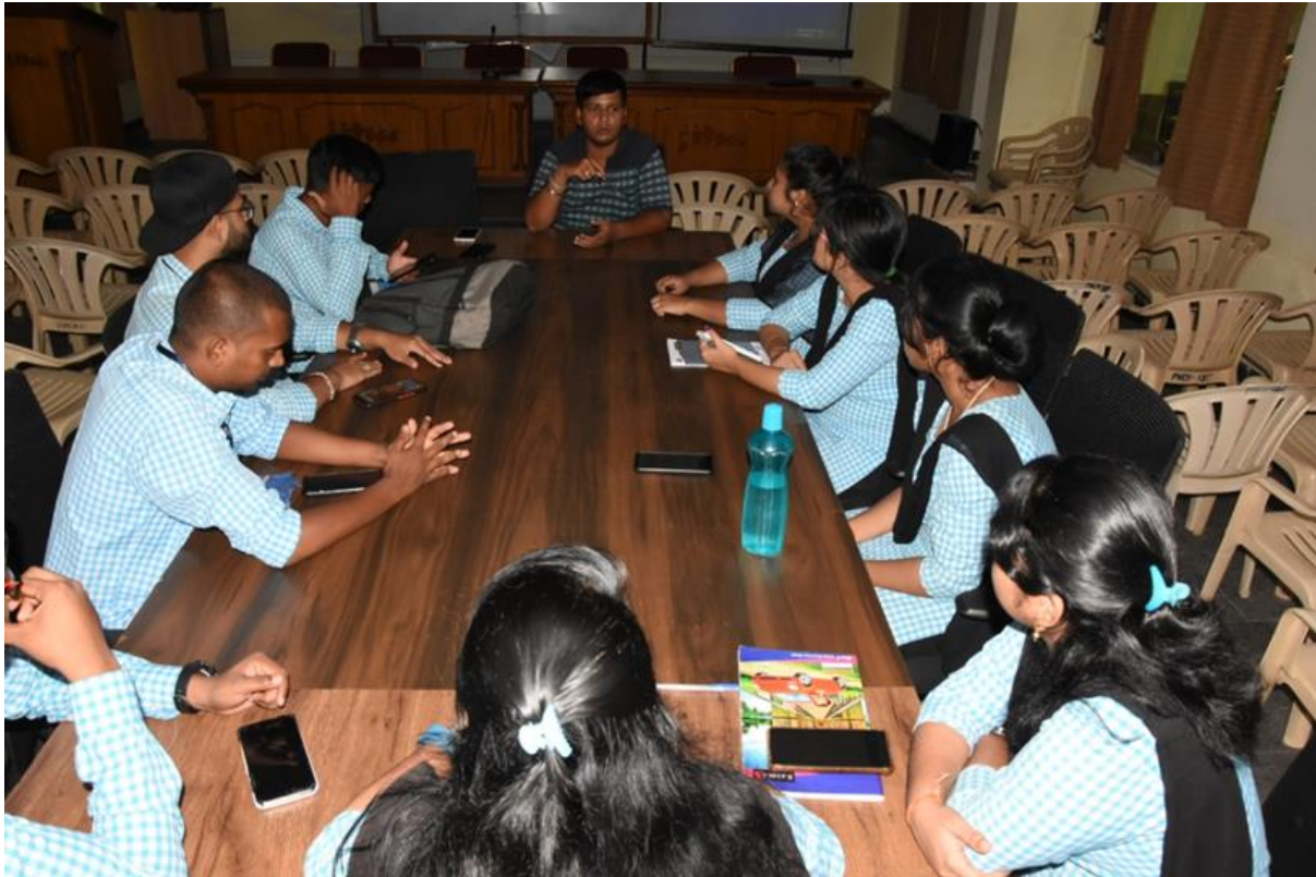
During communication skills exercises on 2 nd October, 2019

The resource persons were of the opinion that a thorough involvement of students in these activities will surely bridge the gap and make them highly befitting for different jobs.