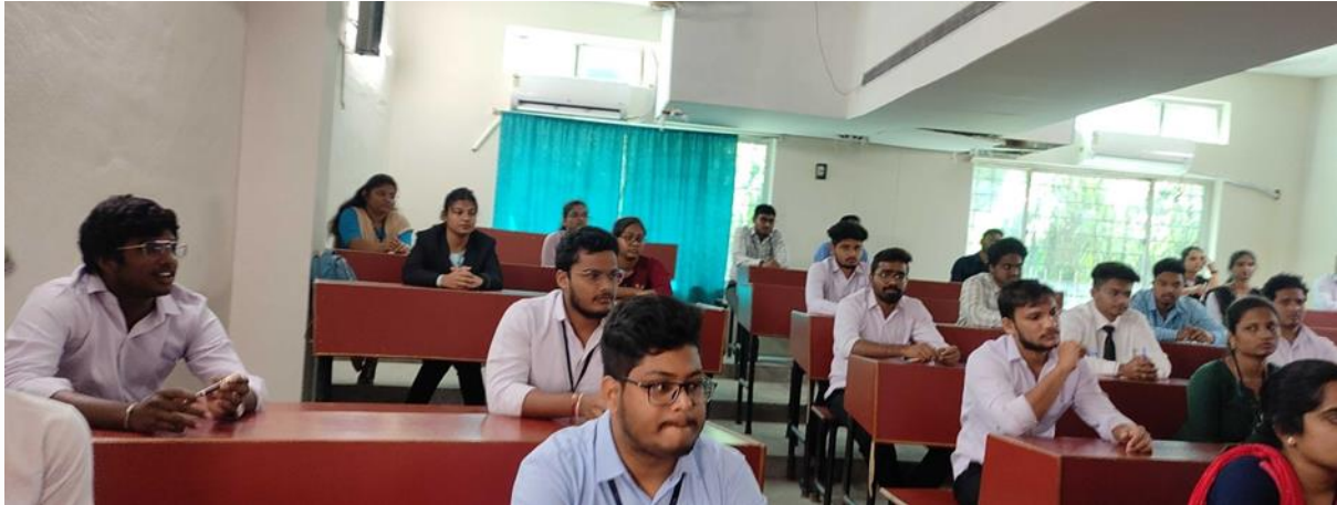
Discussion on the case study on 3 rd Sep 2018

The workshop truly provided a platform for students to learn about attitude and social cognition. In the concluding part of the workshop, a few participants gave their feedback explaining how the program helped them improve their perception in a better way. Informative and insightful feedback was given at the end of the session.