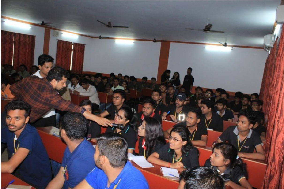
Students Talk about their Dream Jobs, 29 th March 2018