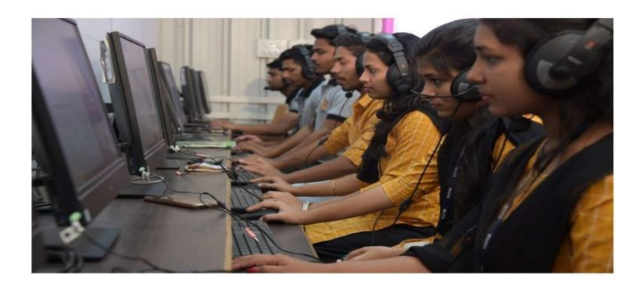
Grammarly Training for MBA students on 15^{th} Dec, 2020