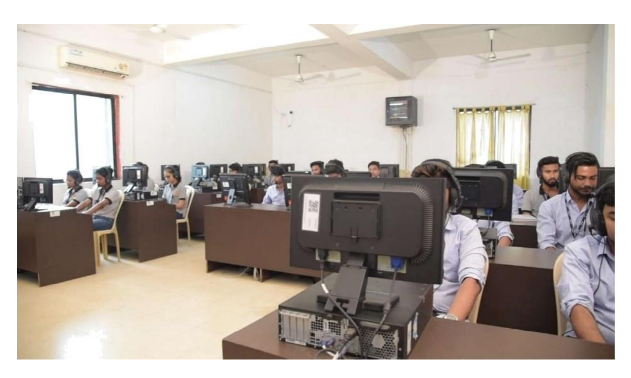
Mock session at Language Lab on 15<sup>th</sup> Dec, 2020