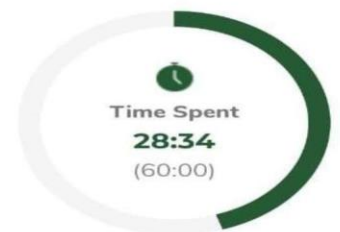
Figure 3: Score Card