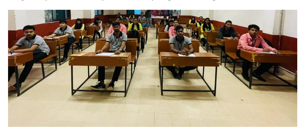
Report Writing, 15 September 2019

Originality and Creativity - The ability to present unique and creative ideas in the report.