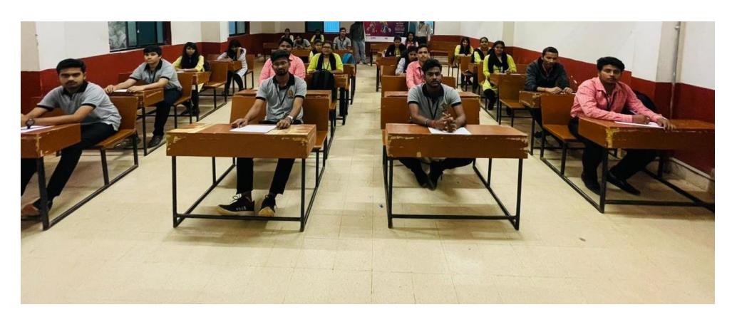
Report Writing, 15 September 2019

Originality and Creativity - The ability to present unique and creative ideas in the report.