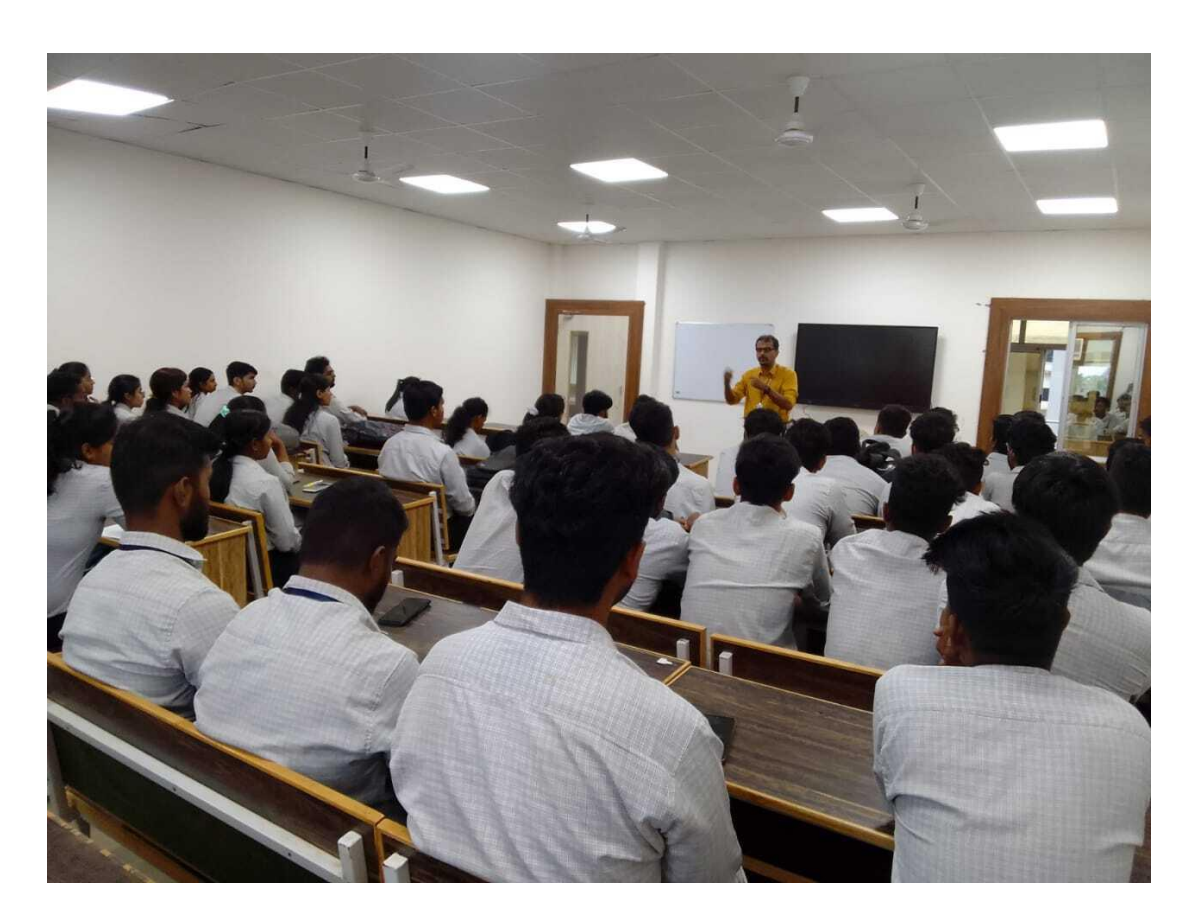
Tips on the Art of Communication, 5 September 2019