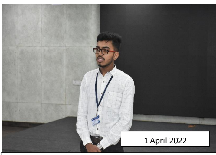
Student's performance on Debate Competition