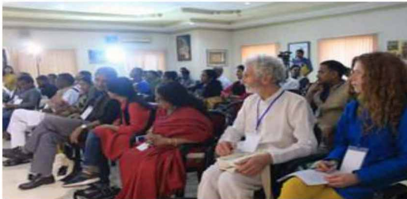
Participants of 4 th Chandrabhaga Poetry Festival 14 January 2018

. The following page provides a snapshot of the event.