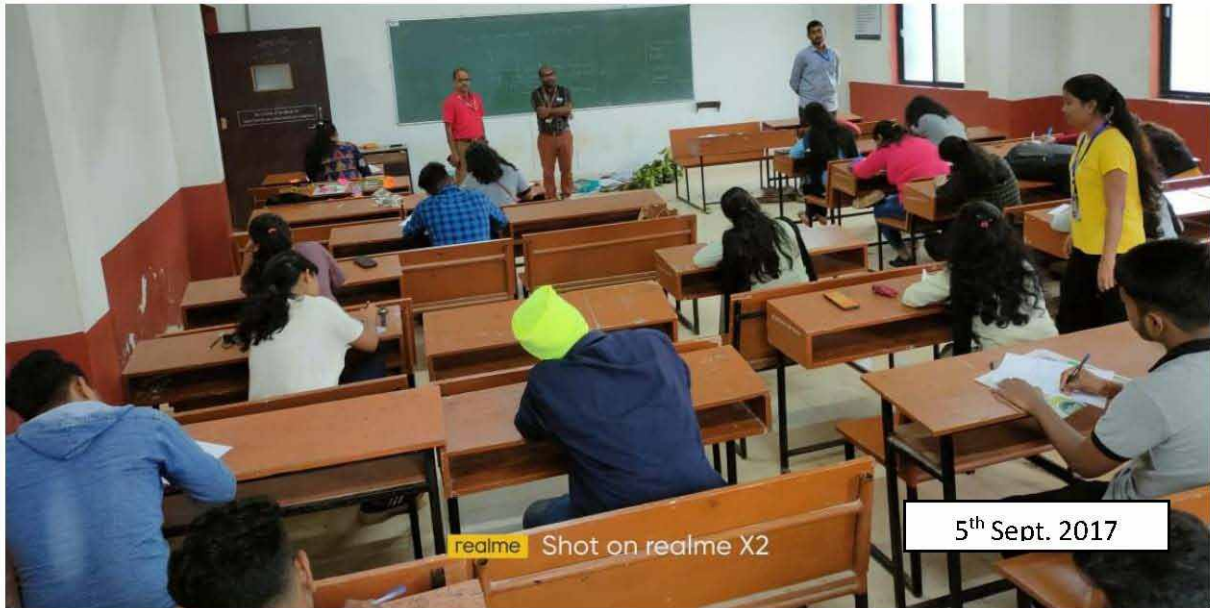
Students participating on Creative Writing event