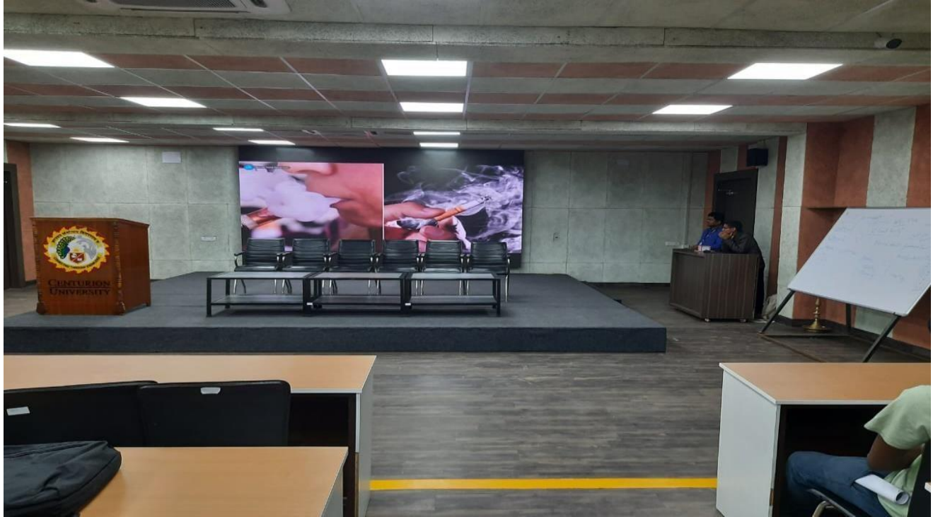
Figure 1 Dt:01.02.2020 Programme on "Ill Effects of Drug Abuse"