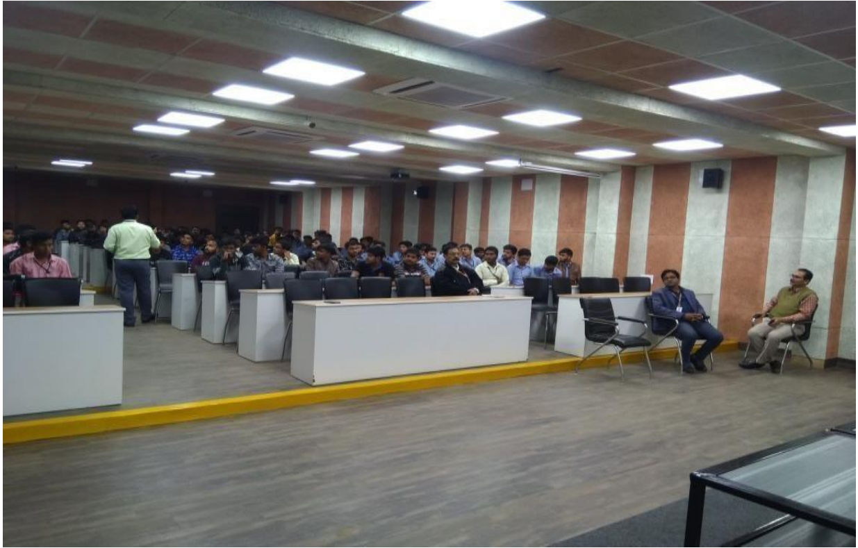
Figure 1Dt:29.12.2019, Programme on "Ill Effects of Drug Abuse"