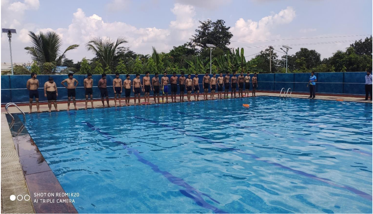
Dt: 20.08.2019, Swimming Training