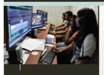
Pre-requisites: Nil Course Type : Audit (Workshop) Duration : 30 Hours