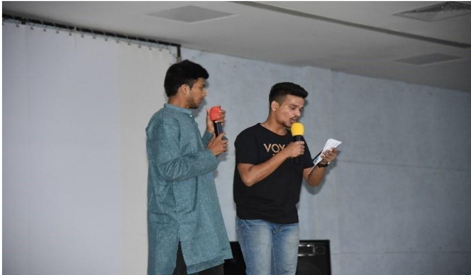
Fig: Debate competition