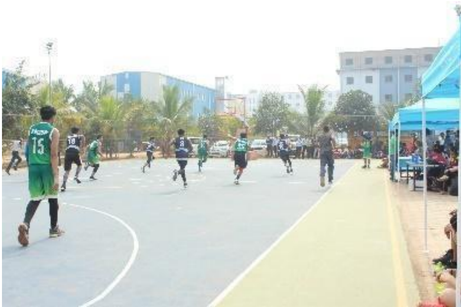
Some photographs Inter Campus Sports meet Basketball Championship (men)

Sport is an amazing concept that improves the lives of people. Students especially need to take part in sports that they find fun because participating in sports will not only help them to improve their physical health but will also give them the mental energy to cope and study well. By playing sports, students release serotonin and other chemicals in the brain and because of this exertion, they will feel more rejuvenated every day. It will help them to stay fit and to have a healthy and positive life. Sports also play a very important role in having stable and healthy mental health. It was organized by Centurion University Bhubaneswar Campus where three different Branches of Centurion University take part and in the final match Paralakhemundi Campus won the winner trophy from Bhubaneswar Campus.