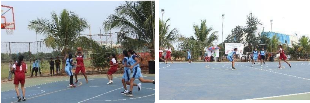
Some photographs Inter Campus sports meet Basketball Championship (women) 19/11/2019

It is organized by Centurion University Bhubaneswar Campus where three different campuses of Centurion University take part and in the final match Bhubaneswar Campus won the winner trophy from Paralakhemundi Campus.