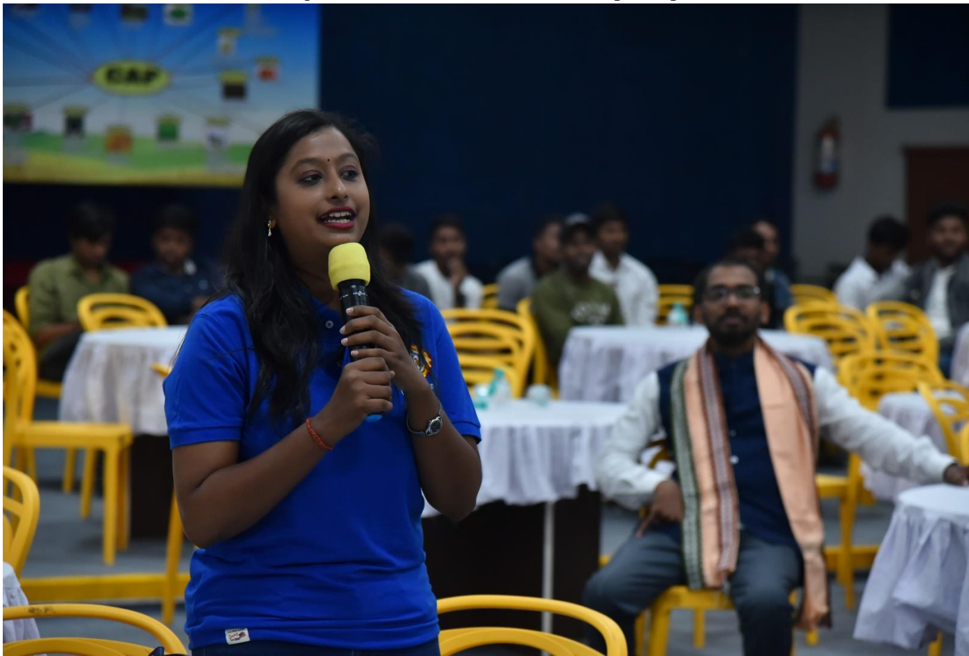
Fig; Guess me competition on Gajajyoti (Annual Techno Cultural Fest)