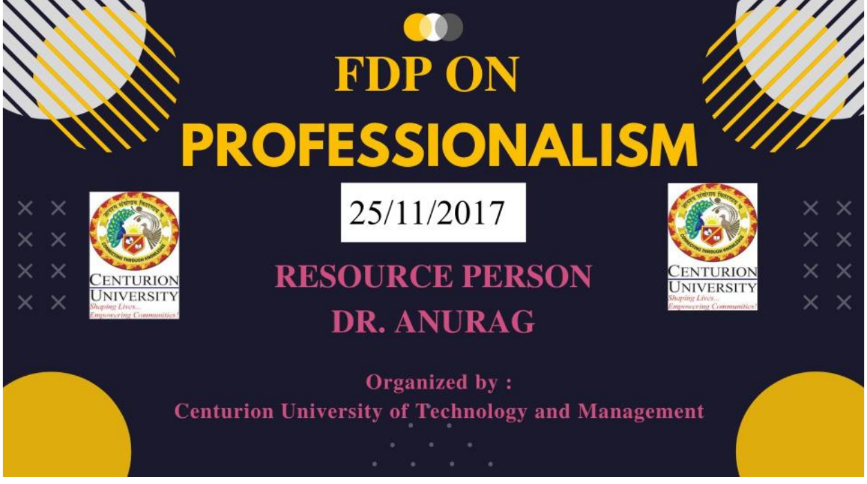
Figure: the brochure of the Faculty Development Programme