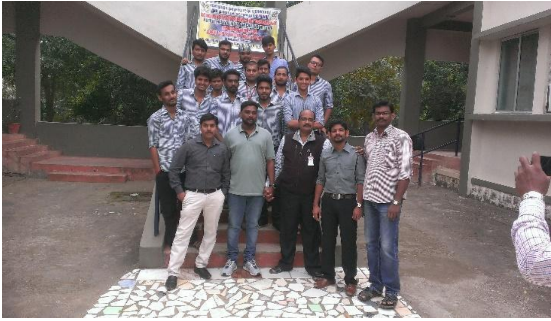
Workshop on NDT level-2 on 20.12.17