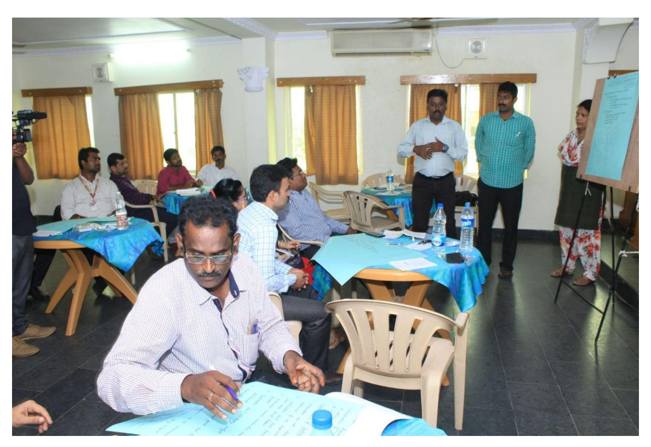
Figure: Participants attending the programme

Outcome: This FDP helps participants to how to become a good facilitator and how to guide the team onboard where they need to go, with no objective other than to lead the team to their destination