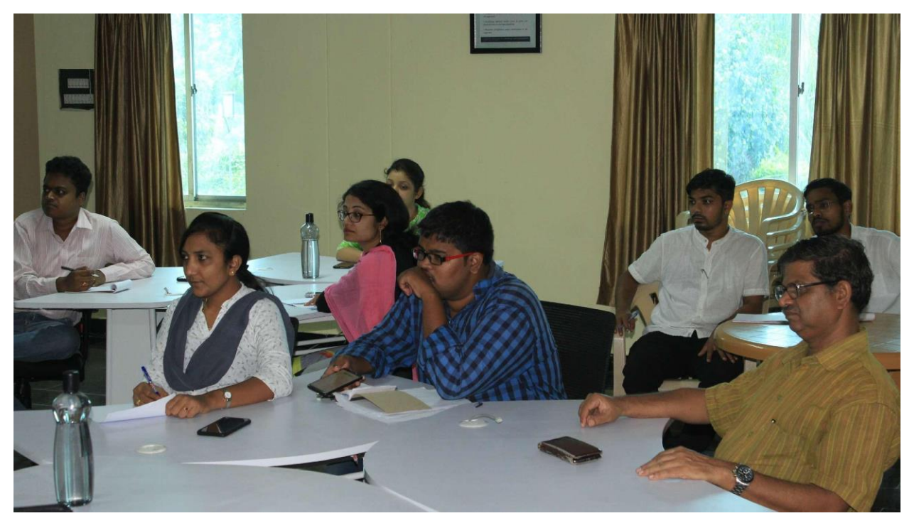
Figure: Participants attending the FDP on Induction programme