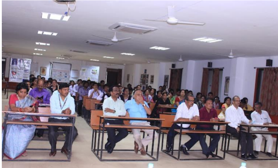
Figure: Picture of the workshop on IELTS