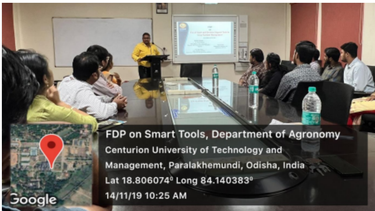
Resource person talk on PNM